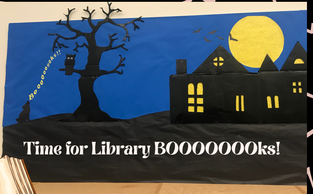
Time for Library BOOOOOOooks!