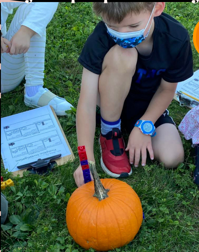
First grade pumpkin investigation!